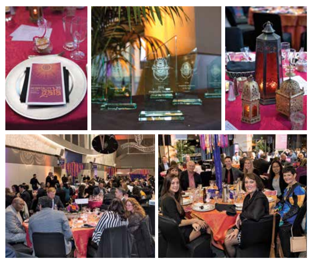
Members and guests enjoy the 25th annual Hospitality Gala presented by the Sacramento Convention Center, Classique Catering, and PSAV in late February.