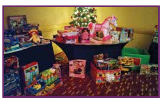
SHA members donated heaps of toys for the Stanford Settlement Neighborhood Center in North Sacramento at the December Holiday Reception at the Courtyard by Marriott Cal Expo.

SHA members gathered December 5 at the Courtyard Cal Expo for the